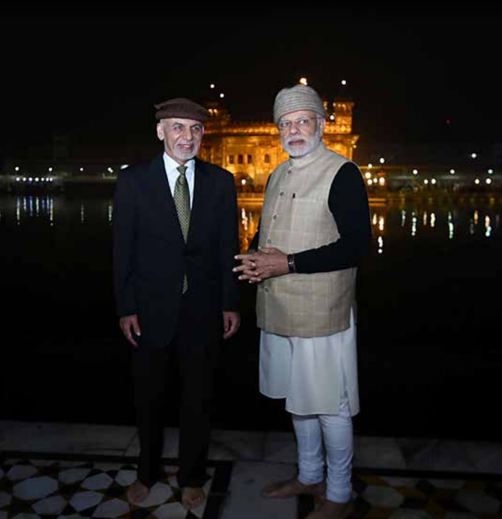
With Afghanistan President Ashraf Ghani at Sri Harmandir Sahib, Amritsar