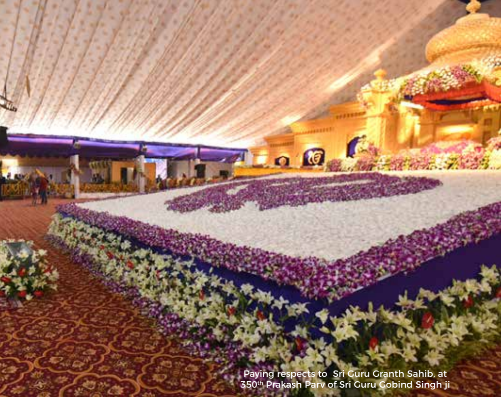
Paying respects to Sri Guru Granth Sahib, at 350 th Prakash Parv of Sri Guru Gobind Singh ji

Whether it is about celebration of holy occasions such as Sri Guru Nanak Dev ji's 550 th birth anniversary or Sri Guru Gobind Singh ji's 350 th birth anniversary, whether it is about justice for victims of 1984 riots or about construction of Sri Kartarpur Sahib Corridor, PM Modi has taken personal interest and led the way in working for the Sikh community.