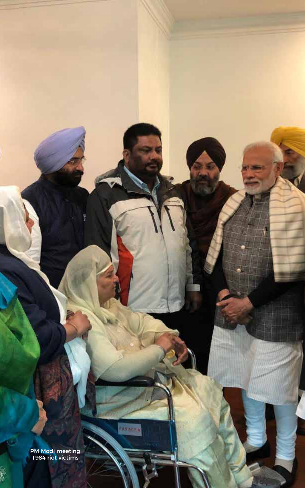
PM Modi meeting 1984 riot victims