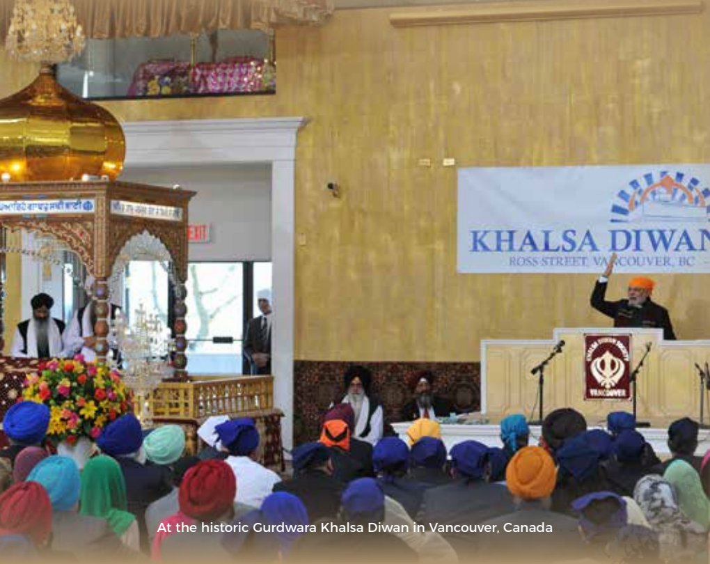
At the historic Gurdwara Khalsa Diwan in Vancouver, Canada