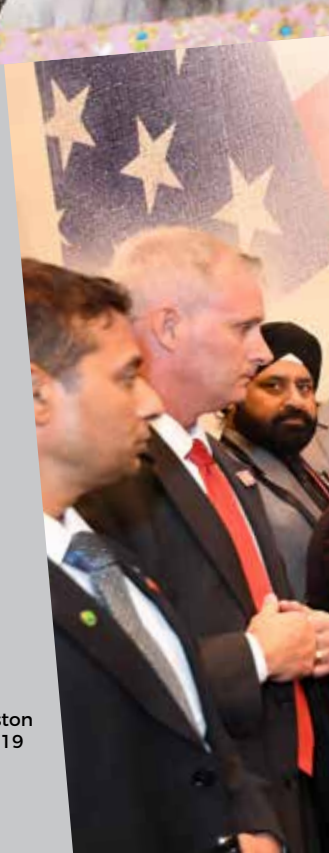
PM Modi honoured by the Sikh community in Houston during the 'Howdy, Modi!' event, September 21, 2019