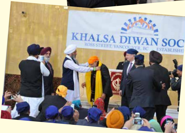
PM Modi being honoured at the Gurdwara Khalsa Diwan at Ross Street in Vancouver, Canada April 16, 2015