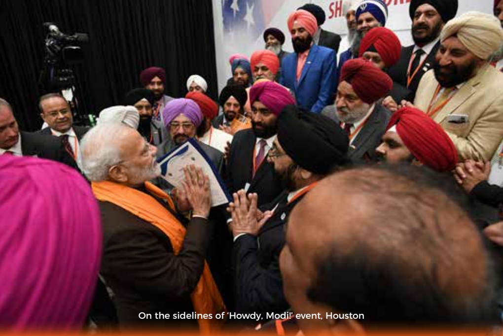
On the sidelines of 'Howdy, Modi!' event, Houston