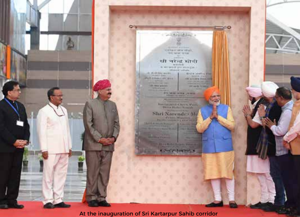
At the inauguration of Sri Kartarpur Sahib corridor