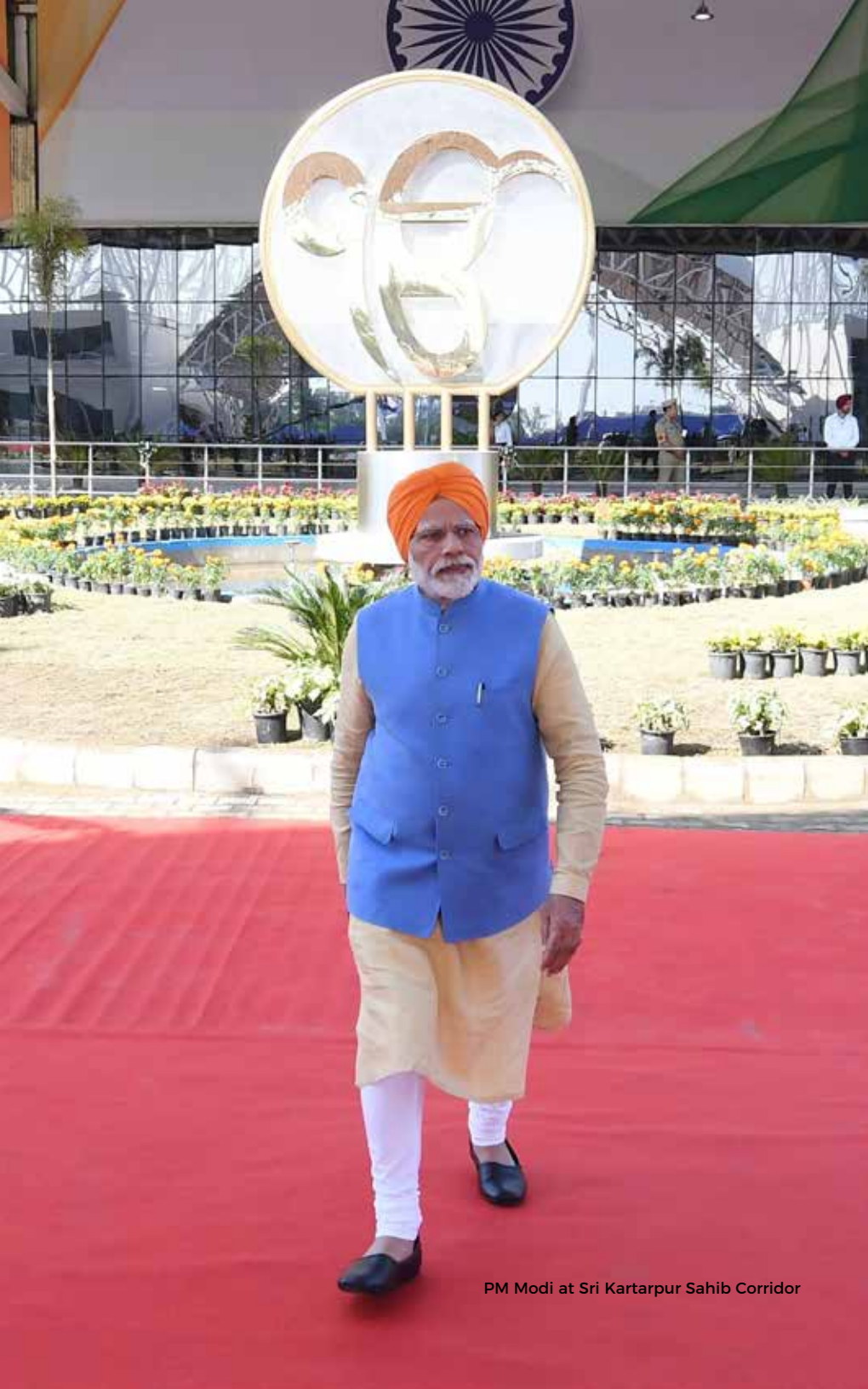
PM Modi at Sri Kartarpur Sahib Corridor