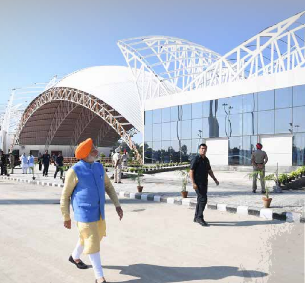
Inspecting the passenger terminal at Sri Kartarpur Sahib corridor