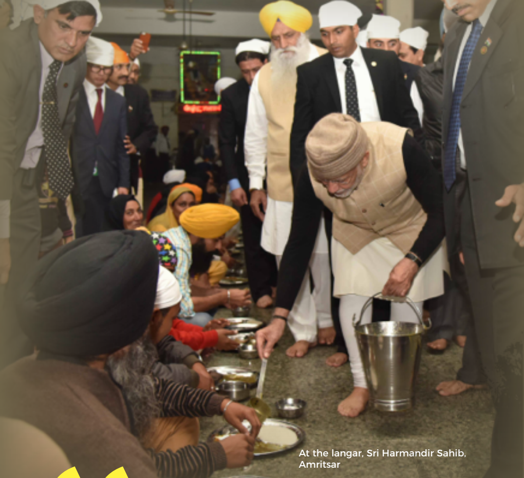
At the langar, Sri Harmandir Sahib, Amritsar