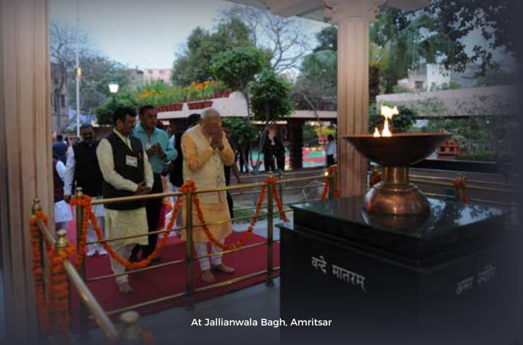
At Jallianwala Bagh, Amritsar