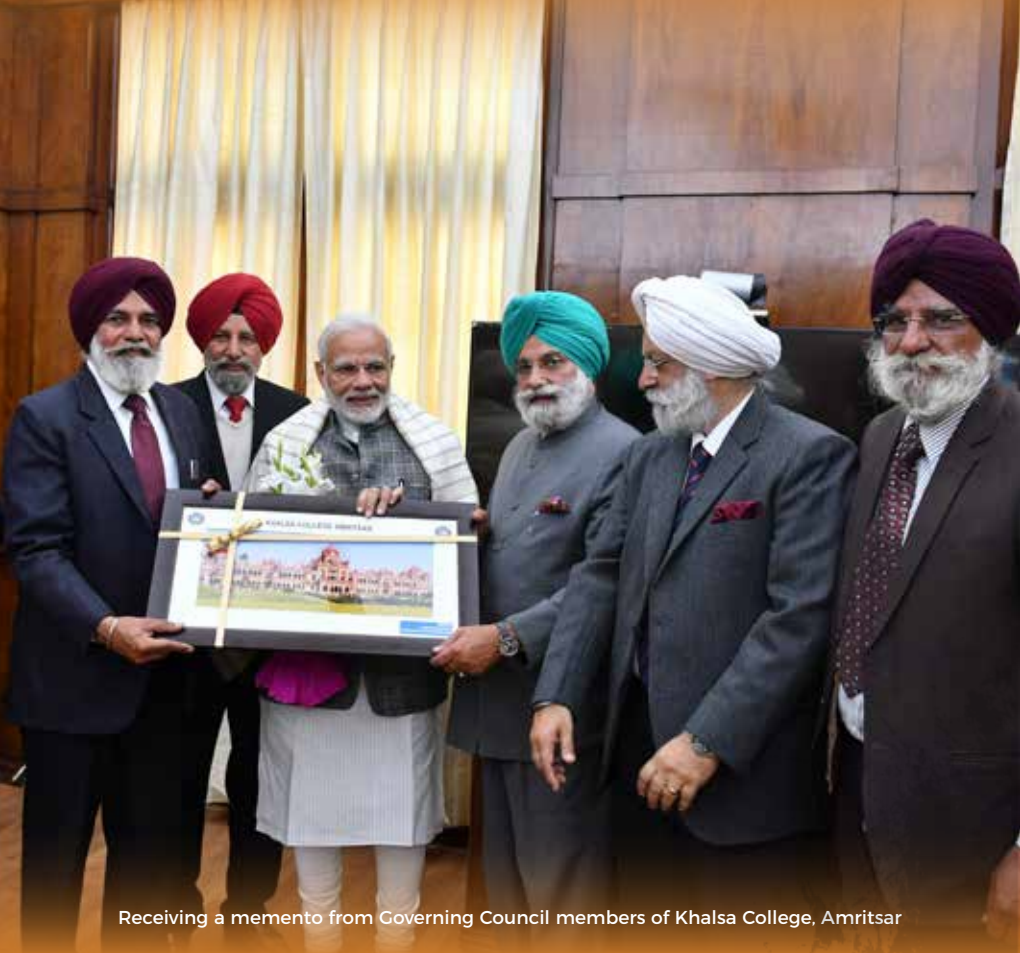
Receiving a memento from Governing Council members of Khalsa College, Amritsar