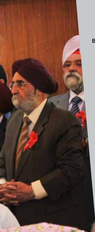
Being presented with Siropa and Kirpan at Bhai Ganga Singh Sabha Gurdwara, Tehran in 2016