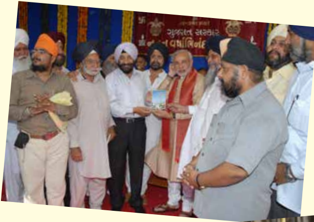
Narendra Modi accepting a memento from Sikh community representatives as Chief Minister of Gujarat during a Gujarati New Year function